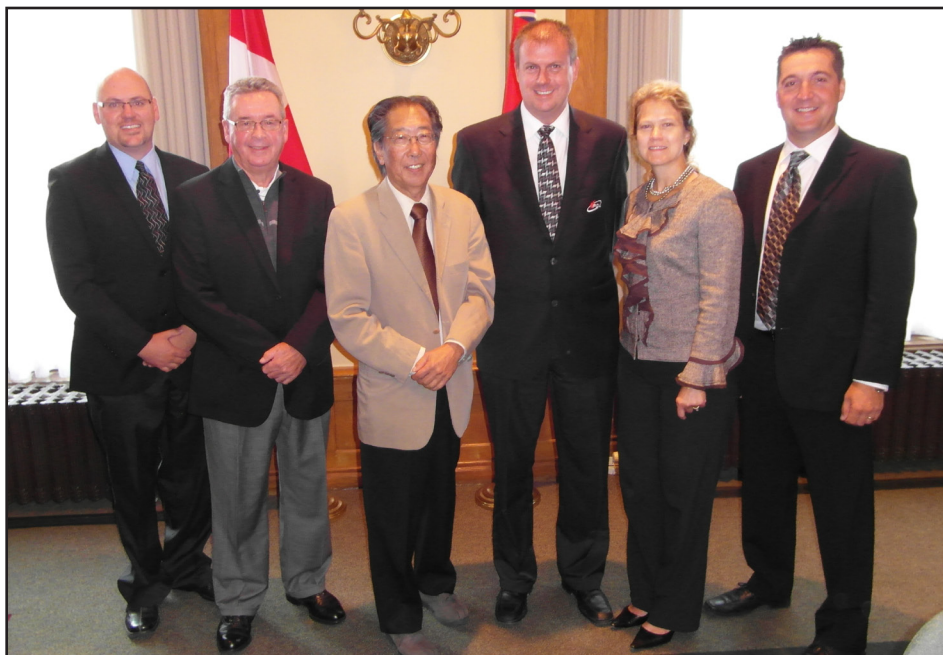
NAGA-ON members share a laugh in the Queen's Park Committee Room where the MPP presentation took place on September 20 th .

An opening salvo to be sure, NAGA ON's next step is to invite MPP's to form an Ontario Golf Caucus committee. This would see representatives of all political parties participate in an open forum two-way dialogue to inform, educate, suggest and resolve issues that currently or in the future affect golf operations in Ontario.